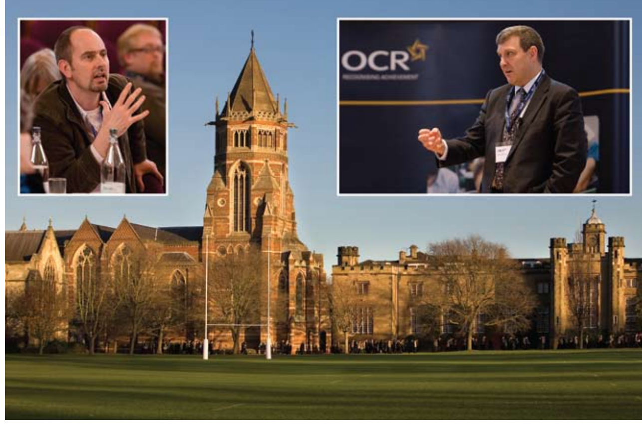
The Successful Thinking for All conference at Rugby School.

More than 100 teachers explored the cross-curricular benefits of thinking skills, at an OCR-hosted conference held at Rugby School, one of Warwickshire's own hotbeds of reasoning and thought.