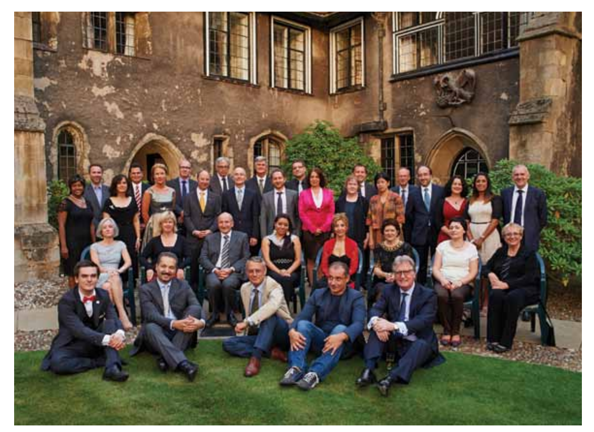
The finalists pictured with Cambridge English Language Assessment staff at Corpus Christi College, Cambridge