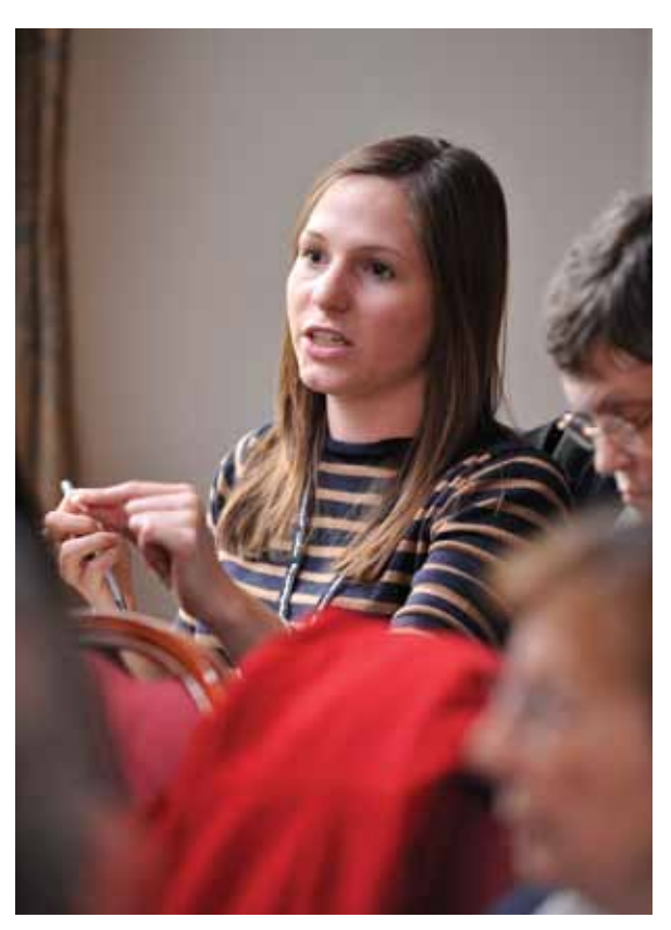
An interested audience at the Labour Party conference had a variety of questions for the panel