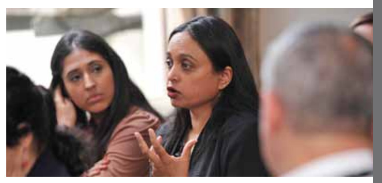
Up for discussion: delegates debated the issues around vocational learning