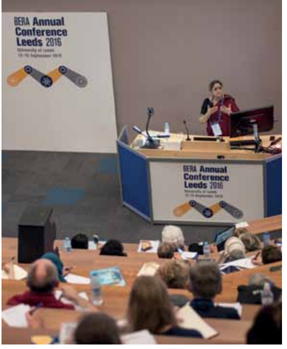
BERA Annual Conference 2016