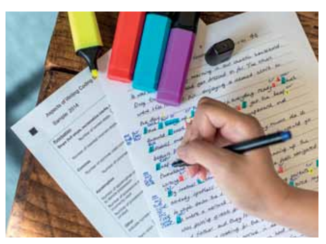
2014 phase of Variations in aspects of writing in 16+ English examinations between 1980 and 2014

For researchers, it acts as a springboard, suggesting new questions and new lines of enquiry. For me as a researcher, it highlights all sorts of things that I'd love to pursue. It's very exciting to be involved in a study like this that sets new hares running."