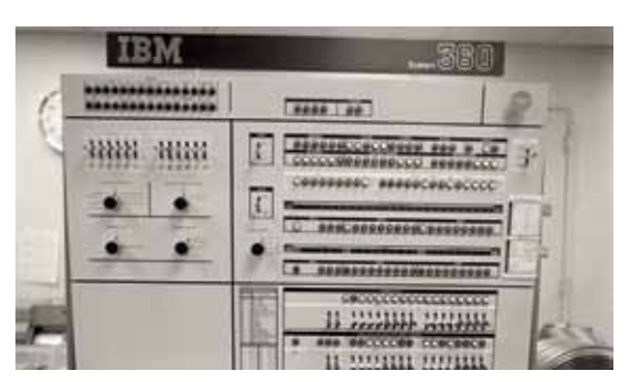
IBM 360/30 computer

After a great deal of fruitful research, TDRU was disbanded in 1985 as the tension between carrying out test development at speed, and research at a sensible pace, proved too much. However, a new research department was established within UCLES: the Council for Examination Development (CED). CED existed in the