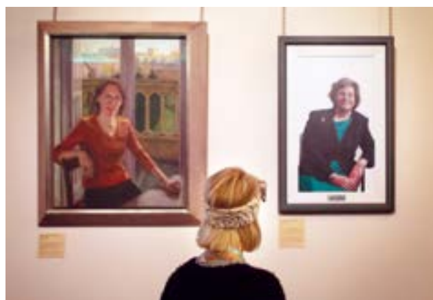
The Rising Tide: Women at Cambridge, Milstein Exhibition Centre at the Cambridge University Library

Cambridge Assessment also sponsored the LEAD 5050 Women in Education Awards 2019, held in Berlin. Now in their third year, the awards recognise and celebrate the achievements of inspirational women worldwide as well as gender and non-conforming individuals, men and organisations who have shown exceptional commitment to gender equality in the workplace.