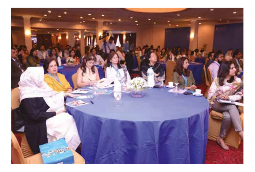
Delegates from schools across Pakistan discussed how to equip learners for a successful life in the modern world.

Schools around the world face significant challenges in preparing students for the future. Cambridge International Examinations held a conference in Pakistan to set out its approach to equipping learners for a successful life in the modern world.