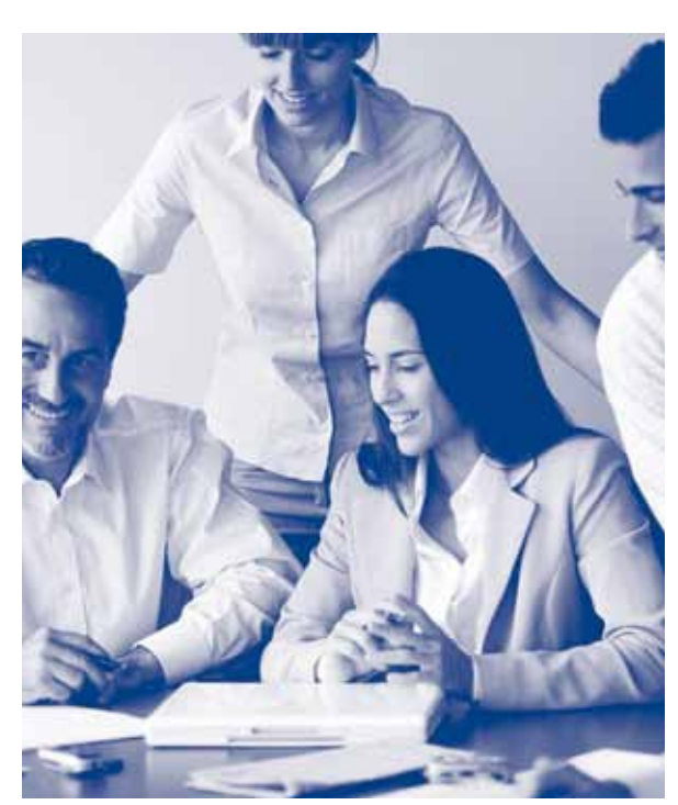
BULATS is a test designed to assess language skills of employees.

in English, Business English Certificate Vantage, and International Certificate in Financial English.