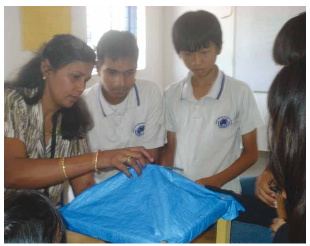
Students at Bangalore International School in India building a device for collecting water as part of a Global Perspectives project.

Worldwide entries for Cambridge IGCSE in the June 2009 examination session grew by nearly 20 per cent. One of the factors behind its global success is the wide and growing range of subject choice.