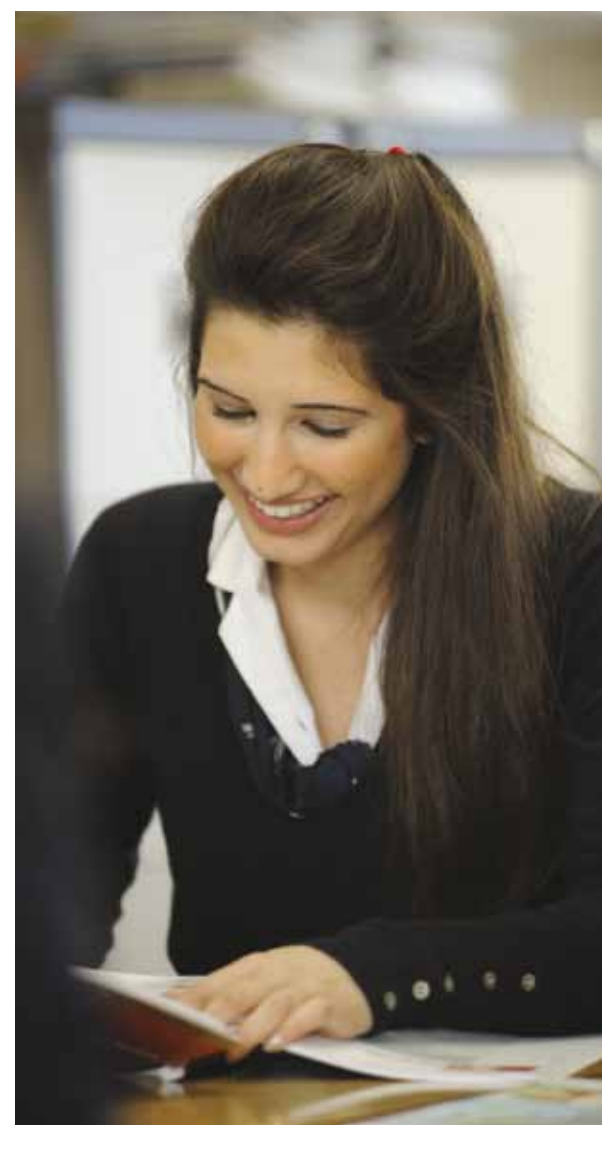
Cambridge Pre-U student at Yarm School, a leading independent school in the north-east of England.

For more information visit: www.cie.org.uk