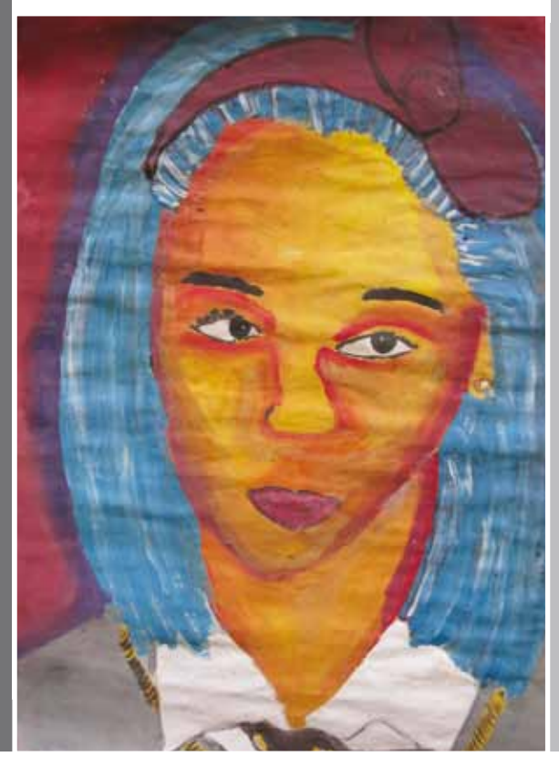
The Prince's Foundation for Children & the Arts

Cambridge Assessment is the brand name of the University of Cambridge Local Examinations Syndicate, a department of the University of Cambridge. Cambridge Assessment is a not-for-profit organisation.