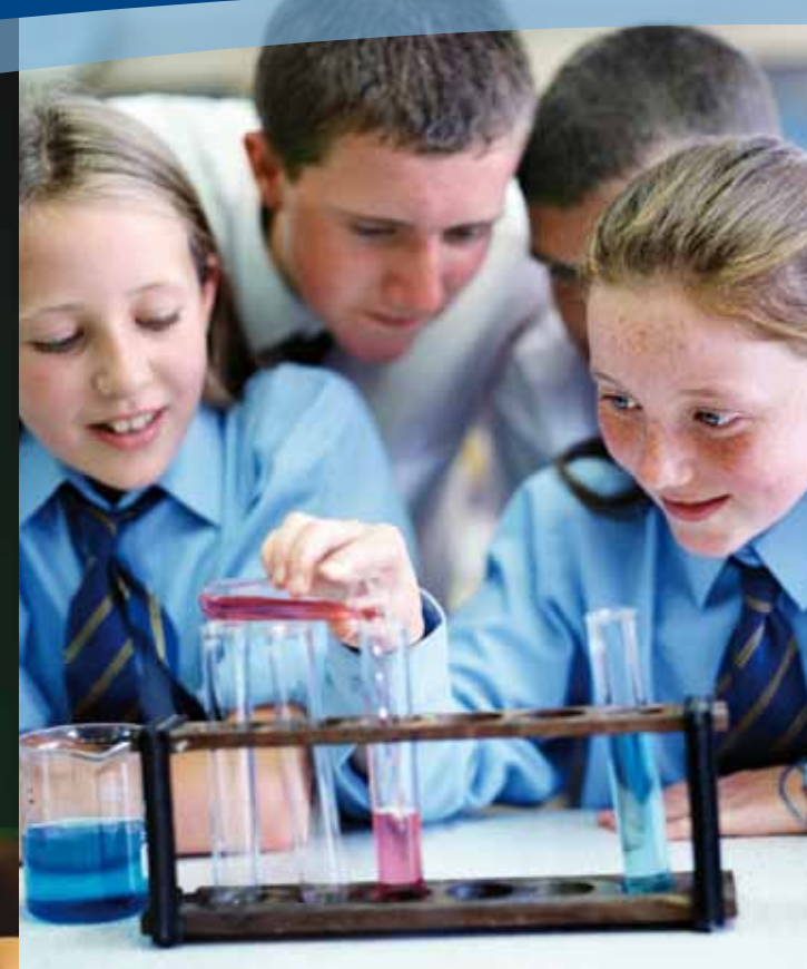
Welcome to Achieve

The latest news from Cambridge Assessment, the University's international exams group.