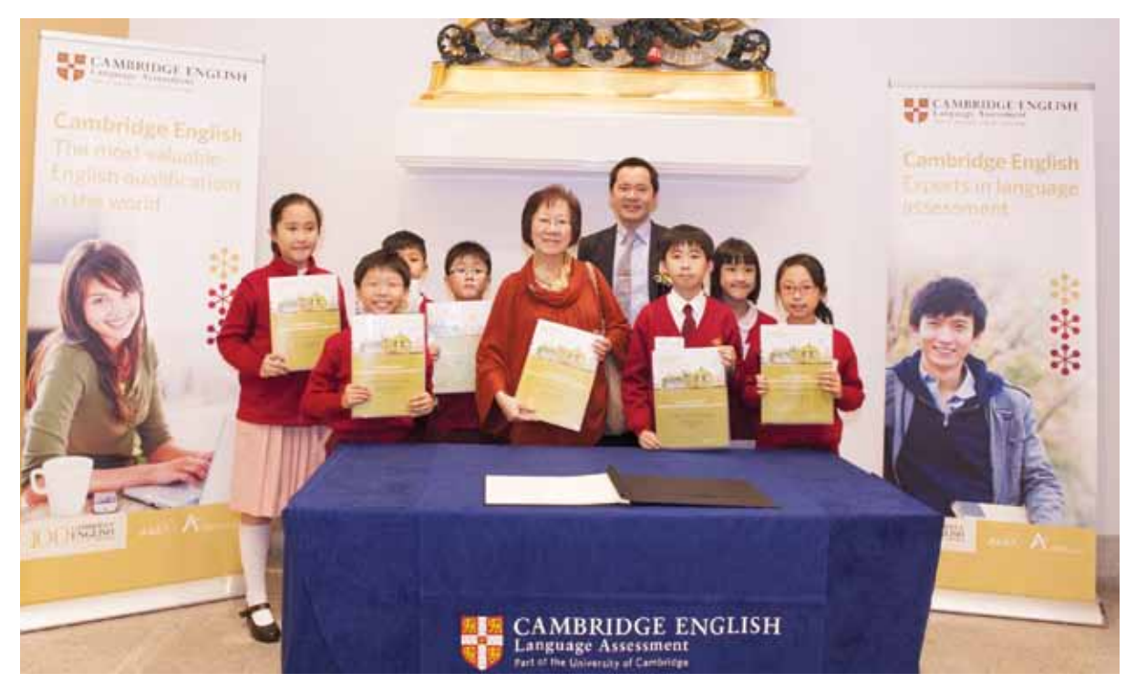
Proud pioneers: children display their certificates of achievement

ESF Educational Services – a well-established provider of quality extra-curricular language and sports courses in Hong Kong – hosted the first test on 24 March. The test was developed in collaboration with Chinese testing services and technologies specialists ATA.