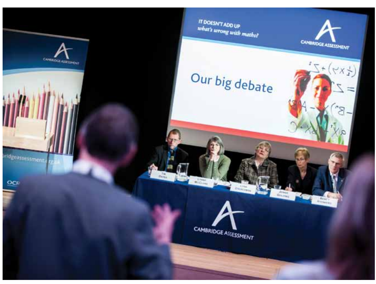
What's wrong with maths? The panel takes questions at Cambridge Assessment's debate in London