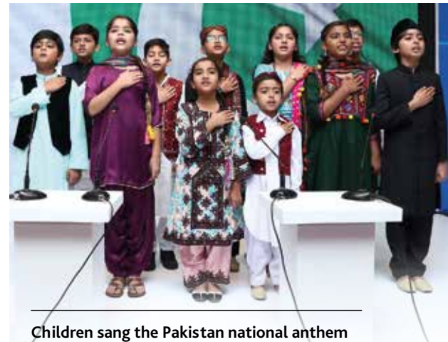
Children sang the Pakistan national anthen to mark the start of the conference.

and ideas. A principal who attended the conference said it had been an excellent learning opportunity for participants: "We not only learn immensely from the keynote speakers, but from our colleagues too and take back home many points to reflect upon afterwards. Cambridge is striving to be an education system which does not prize test scores as the ultimate goal, but wants its teachers and learners to have a strong virtue of reflection as well."