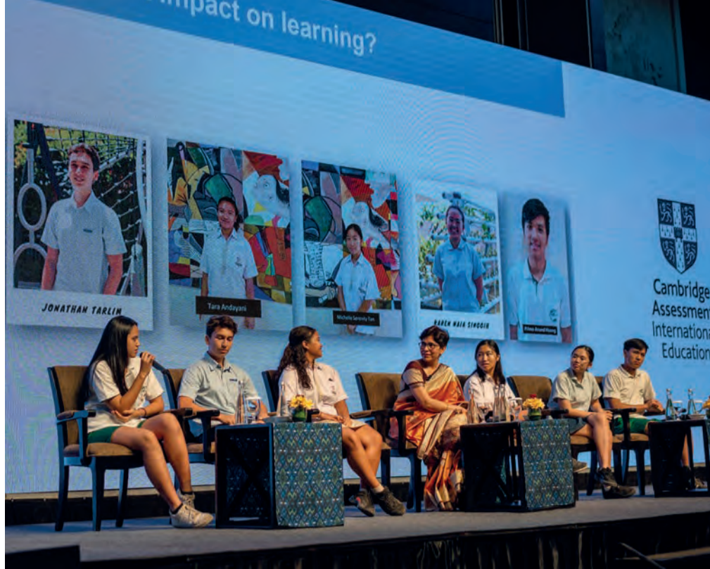
Six learners from three local Balinese schools shared their experiences of a Cambridge International education at the conference

Indonesia was chosen to host Cambridge Assessment International Education's 2019/20 series, hot on the heels of an announcement by the country's new education minister that he would place innovation and teacher development at the forefront of educational reforms.