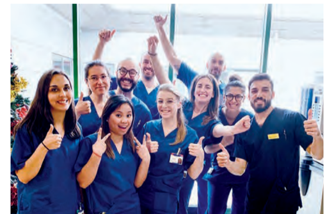
Recently qualified OET candidates now employed in the Royal Devon and Exeter NHS Foundation Trust

It was also announced that the UK's Nursing and Midwifery Council (NMC) would amend the OET Writing requirement for overseas nurses and midwives taking OET. This means that the Council will accept a grade C+ in Writing alongside a minimum B grade in the OET Listening, Reading and Speaking sub-tests.