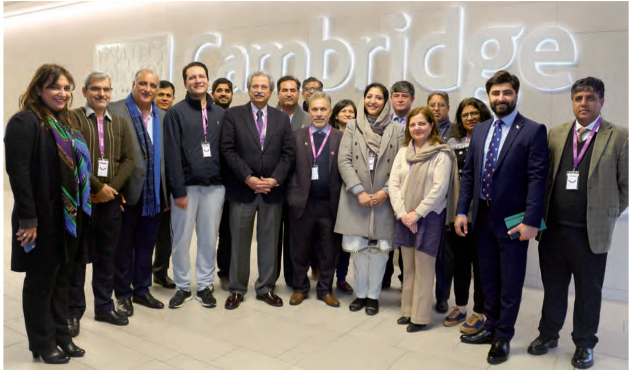
Delegates from the Pakistan Ministry of Education at a Leadership in National Education course