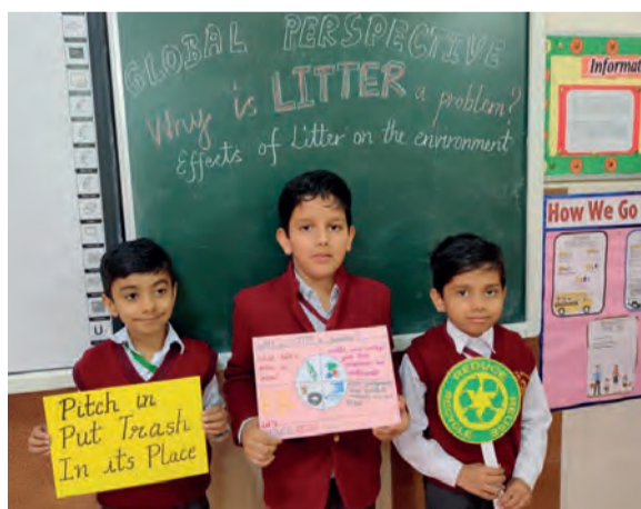
Young learners from Kulachi Hansraj Model School in Delhi during Cambridge Global Perspectives Week

Almost all students who took part in the survey (96%) believe it is important to learn about global issues in school.