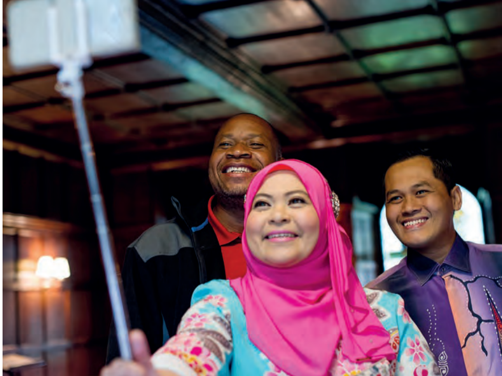
Delegates on the Cambridge International Study Programme, run by the Cambridge Assessment Network

The main Cambridge International Study Programme covers international issues in education including