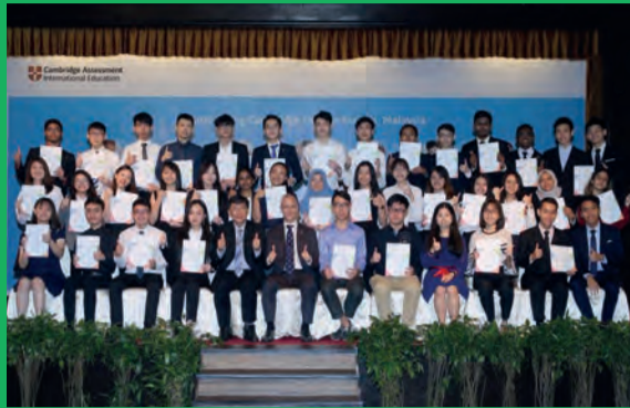
Thirty-nine Malaysian students were awarded Top in the World for Cambridge International AS Level Maths

More than 190 students from 58 schools in Malaysia were named top achievers at Cambridge Assessment International Education's Outstanding Cambridge Learner Awards.