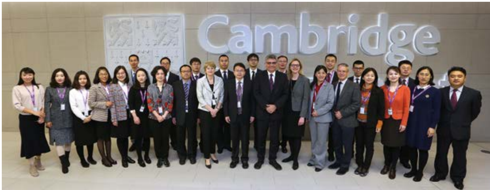
Representatives from NEEA pictured with people from Cambridge English and Cambridge Assessment during a meeting in 2018 to celebrate 25 years of collaboration.