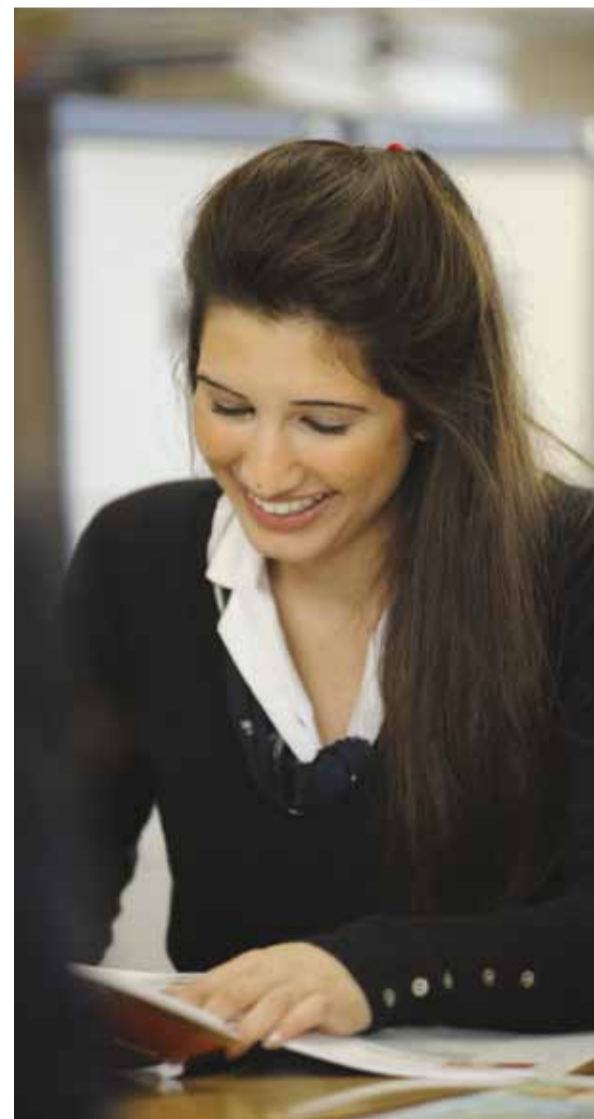
Cambridge Pre-U student at Yarm School, a leading independent school in the north-east of England.

For more information visit: www.cie.org.uk