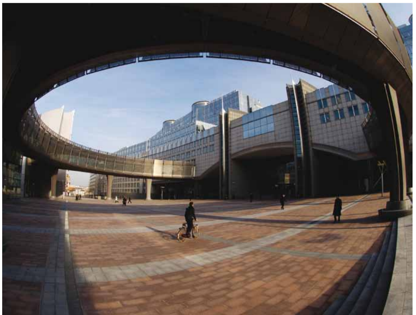
The European Parliament's Altiero Spinelli Building, Brussels.