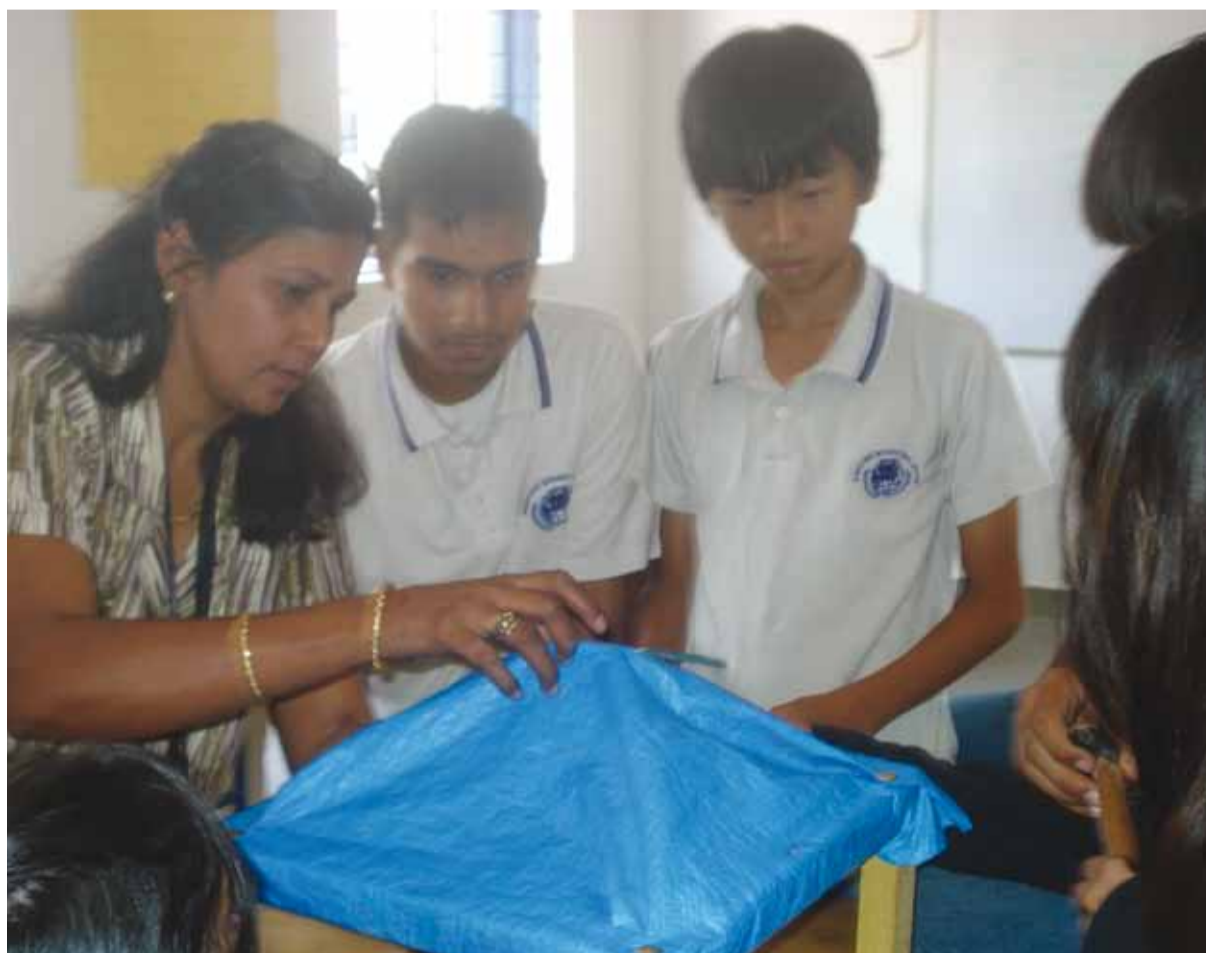
Students at Bangalore International School in India building a device for collecting water as part of a Global Perspectives project.

Worldwide entries for Cambridge IGCSE in the June 2009 examination session grew by nearly 20 per cent. One of the factors behind its global success is the wide and growing range of subject choice.