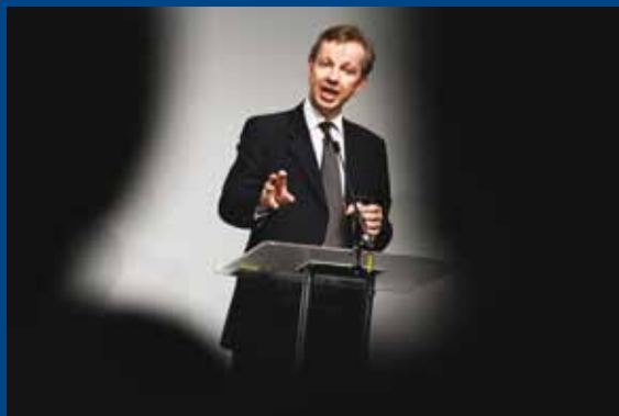
Michael Gove MP, Shadow Secretary of State for Children, Schools and Families.