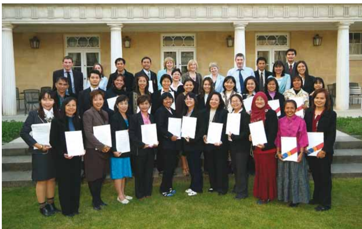
English language teachers from Thailand during their four-week training course in Cambridge.