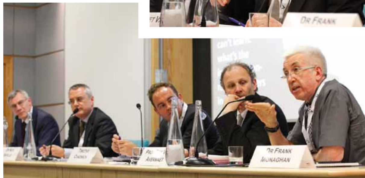
The panel discussing how the curriculum can respond to the impact of non-native speakers in schools.

To view the debate and download presentations, visit www.cambridgeassessment.org.uk