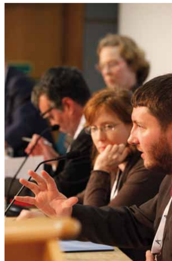
The presenters sharing their experiences and views on the impact of EAL on teachers and the education of mainstream students.