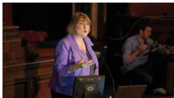
Baroness Brinton, Liberal Democrat.

The debate took place to mark a major vocational initiative – the launch of OCR's new post-16 Cambridge