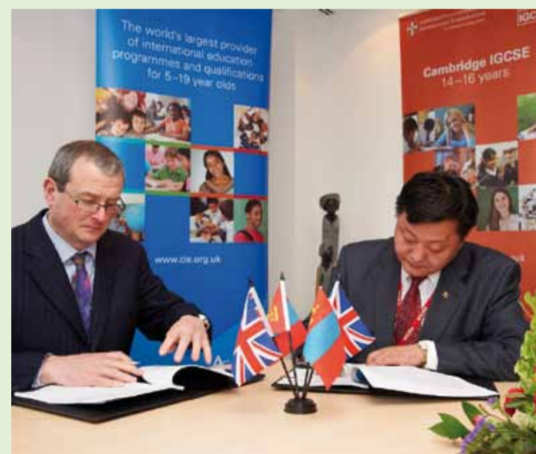
Simon Lebus, Group Chief Executive of Cambridge Assessment (left), and Minister of Education, Mongolia, H.E. Yondon Otgonbayar, signing the agreement on 13 April 2012.

This initiative in Mongolia is one of many international education projects undertaken by Cambridge International Examinations. The exam board works in partnership with more than 30 ministries of education around the world, and is currently involved in projects to support countries in raising educational standards, including Kazakhstan, Bahrain and Egypt.