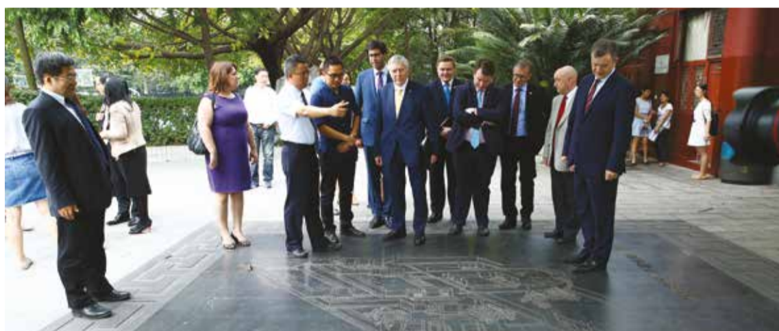
The delegation heard how the school stands on the site of the first Chinese state school, founded around 141BC.

school, Cambridge programme partners and the Chengdu government for their steadfast support. He pointed out that this Cambridge International A Level programme has a zero failure rate.