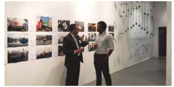
Talking migration history at the launch.

The competition complements the new GCSEs but is flexible so teachers could set it during lessons on migration, as part of an extra-curricular activity, or as a revision exercise.