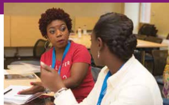
The conference explored the theme of 'Leading learning' through a series of workshops (above) and keynote speeches (below).