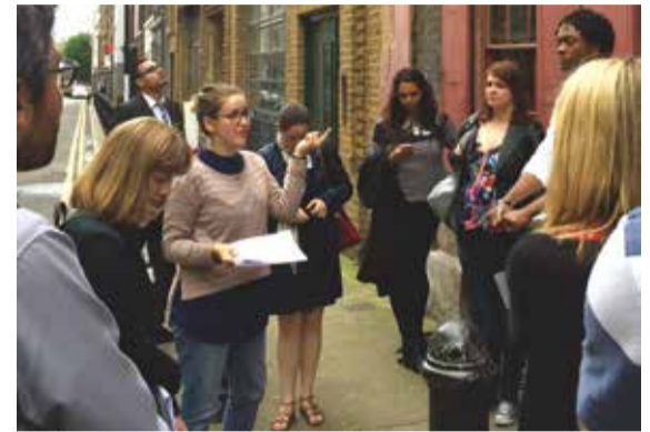
Teachers discover the rich history of immigration in London’s Spitalfields area.