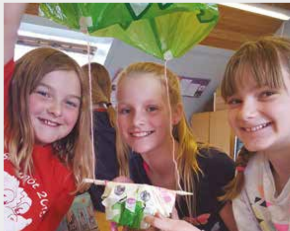
Students at Iceland's first Cambridge school, Landakotsskóli.

"We are immensely proud to be the only school in Iceland to offer Cambridge programmes. We are confident that Cambridge will support our vision of being an empowered and connected global community, where learning is adaptive, continuous and relevant."