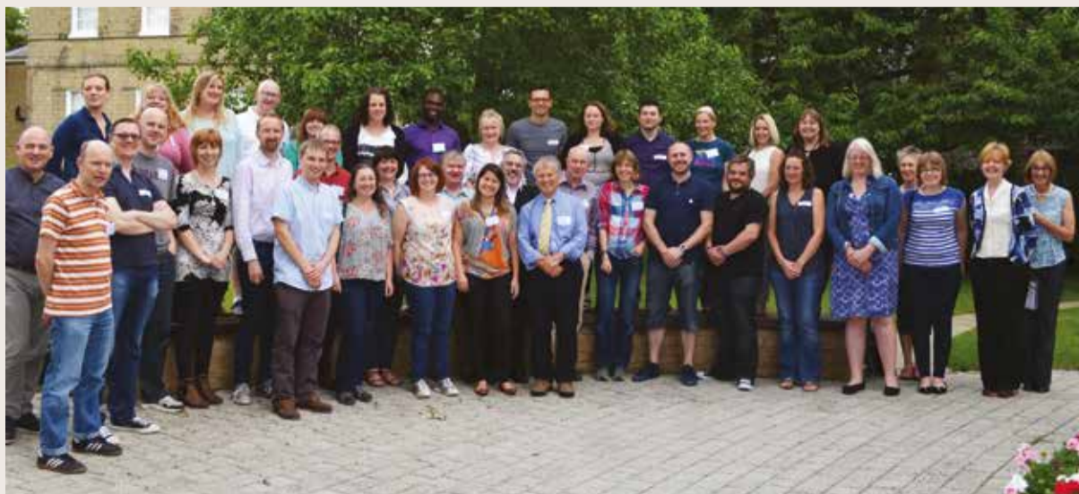
Students and tutors on the 2015/16 Postgraduate Certificate in Educational Assessment and Examinations course.

The 2016/17 course, which was fully booked, finishes in July next year.