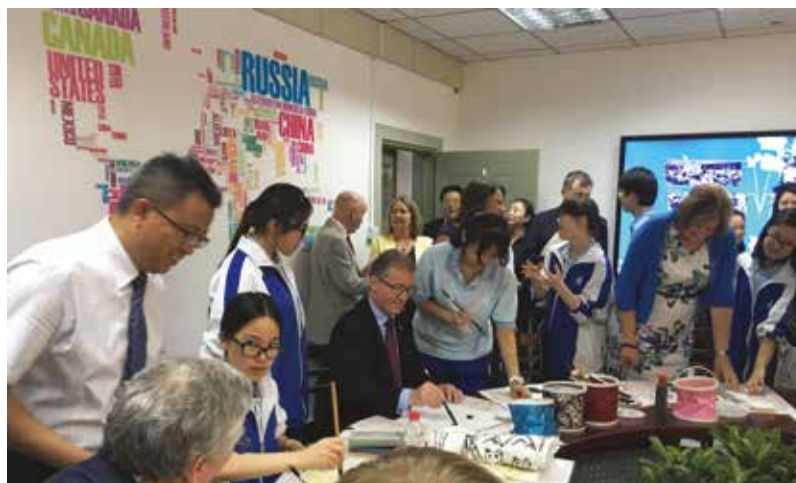
The highlight of the visit was a campus tour.