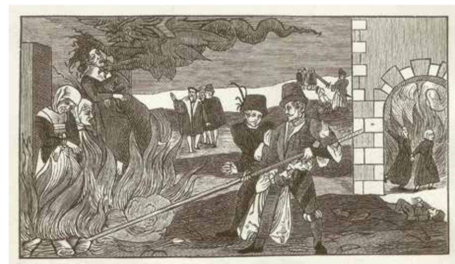
'Witch-burning in the County of Regenstein', Germany, 1550.

"It enables students to look at the wider historical themes of gender, legal change, and religious tension, and to think about change over time and regional variation in witch persecution. More broadly I would