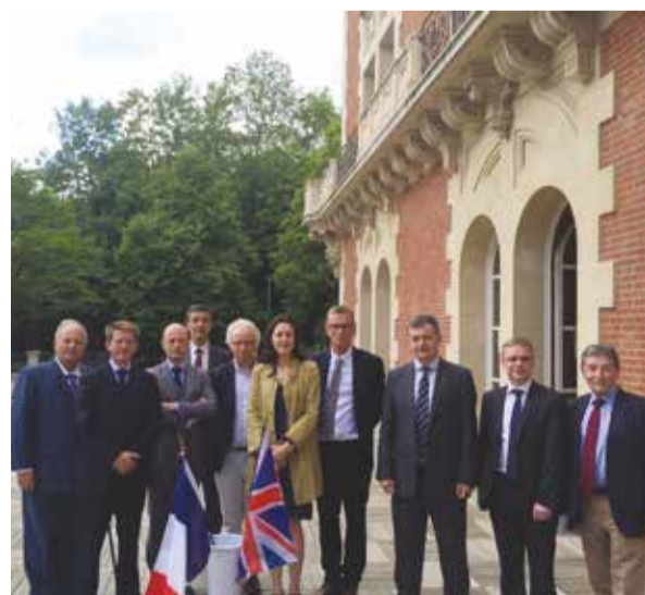
Cambridge has been working with the French Ministry of Education since 1984.