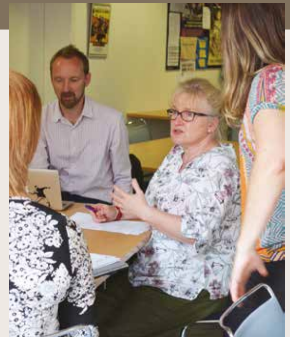
Day schools gave delegates the opportunity to learn from each other (above) as well as from the course tutors (below).