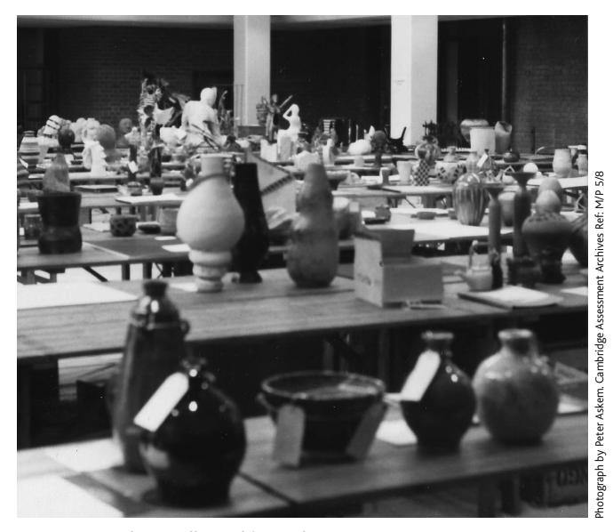
Figure 2: Artwork in 1 Hills Road for marking

Literature every question paper between 1877 and 1937 inclusive (Table 2) required candidates to quote verbatim from memory fairly substantial sections of the prescribed text. Earlier question papers used to require candidates to know the precise meaning, usage and etymology of words in the texts, and on occasion, questions would require candidates to quote a line in which a particular word appeared. Later question