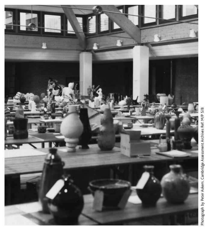
Figure 2: Artwork in 1 Hills Road for marking

In some instances practical considerations have affected the practice of assessment.