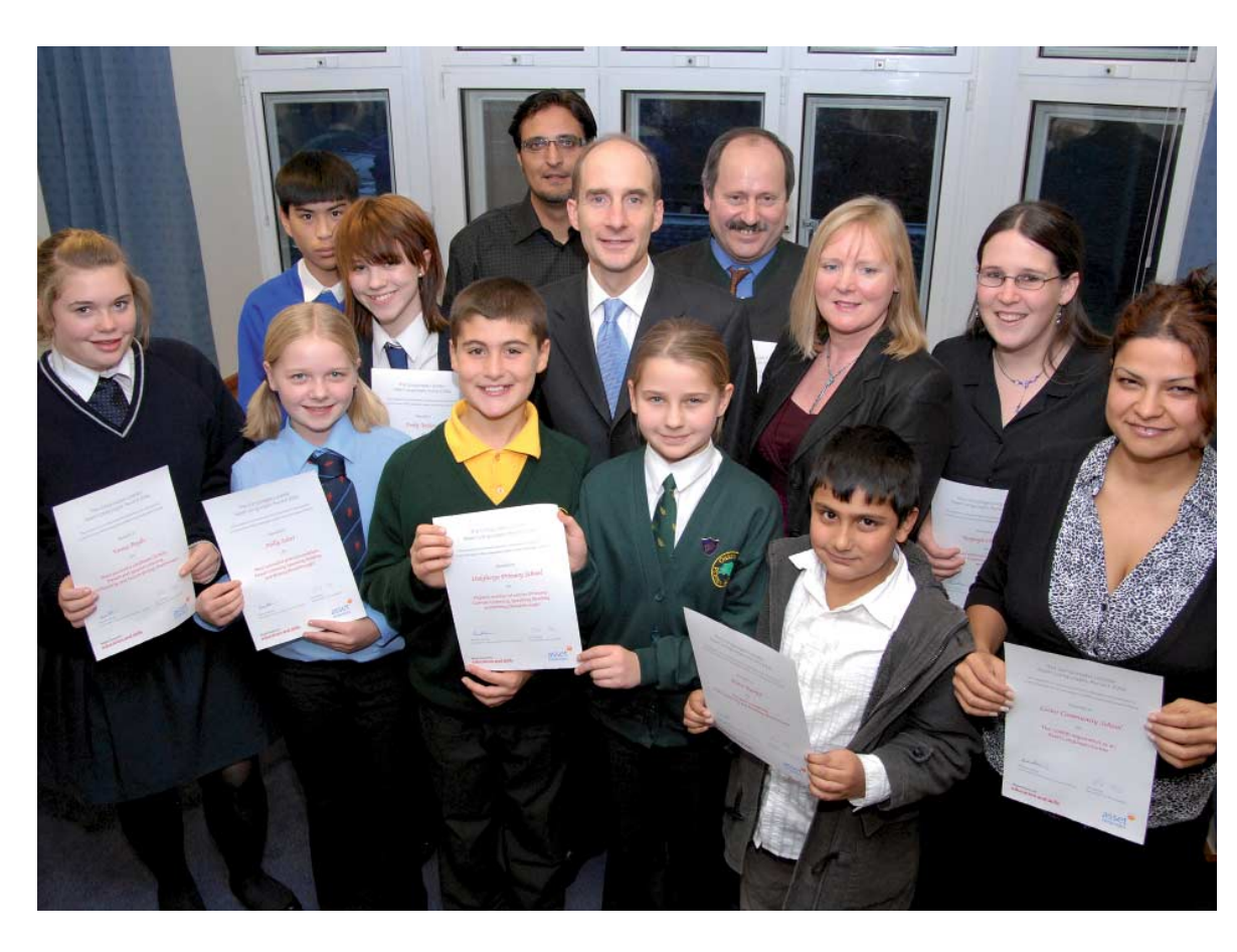
Schools Minister, Lord Adonis, hailed the success of thousands of language learners at an awards ceremony in London in December 2006. Lord Adonis presented awards to the most successful Asset Languages candidates since the programme was launched in September 2005 by OCR, as the national assessment scheme for the DfES' Languages Ladder.