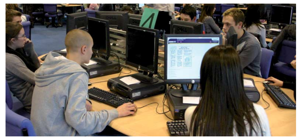
80 Farnborough Sixth Form College students sitting OCR IT Key Skills Level 2 exams using privacy filters.

Privacy filters, normally used to prevent industrial espionage, were used by 80 students in their OCR IT Key Skills Level 2 exams to help combat cheating.