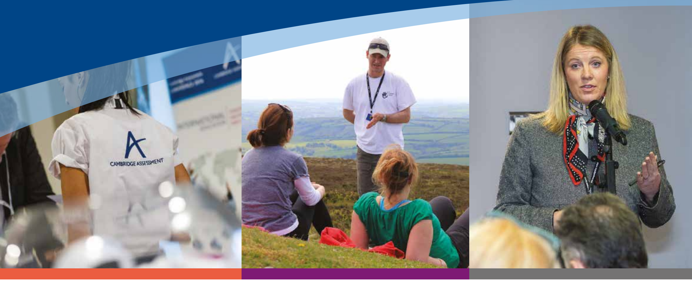
Welcome to Achieve The latest news from Cambridge Assessment, the University's international exams group.

Why 'risky' fieldwork is a good thing How we should be taking chances with learning outcomes. see page 5