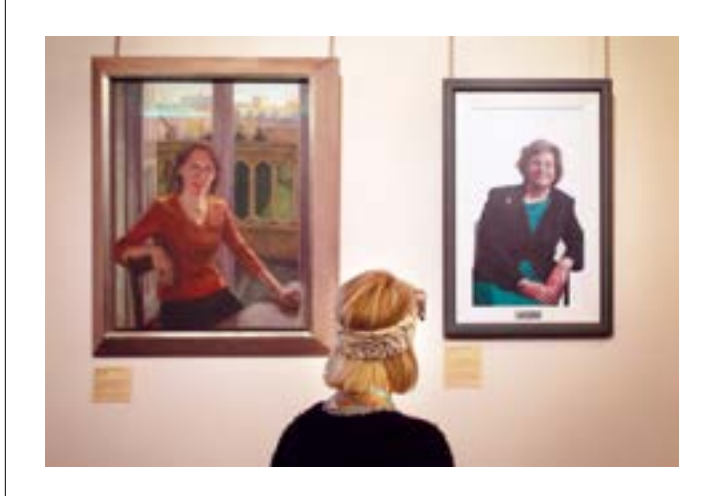
The Rising Tide: Women at Cambridge, Milstein Exhibition Centre at the Cambridge University Library

Cambridge Assessment also sponsored the LEAD 5050 Women in Education Awards 2019, held in Berlin. Now in their third year, the awards recognise and celebrate the achievements of inspirational women worldwide as well as gender and non-conforming individuals, men and organisations who have shown exceptional commitment to gender equality in the workplace.